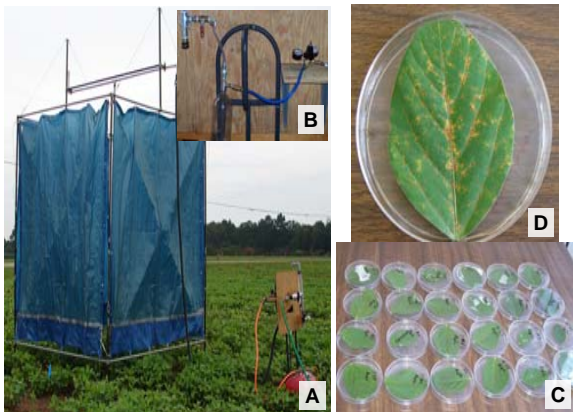
Figure 1. (A) Rainfall simulator in a soybean field with the control unit. (B) A close up of spore injector on rain simulator control unit. (C) Detached leaf bioassay setup. (D) Close up of an infected leaf from the detached leaf bioassay.

Soybean rust, caused by the fungus Phakospora pachyrhizi , is known to spread vast distances through the atmosphere. Rainfall washout has been indicated as the primary deposition process for this pathogen in the central soybean producing regions of the U.S. (Barnes, 2009; Isard, 2007). Determining the depth at which P. pachyrhizi urediniospores are deposited within a soybean canopy is critical to understanding disease development. Viable spores deposited low in a soybean canopy will be exposed to more favorable environment conditions, and thus will have a greater likelihood for infection. The objective of this poster was to determine the effects of rainfall intensity, plant height & row spacing on the vertical distribution of urediniospores deposited by rainfall within a soybean canopy.